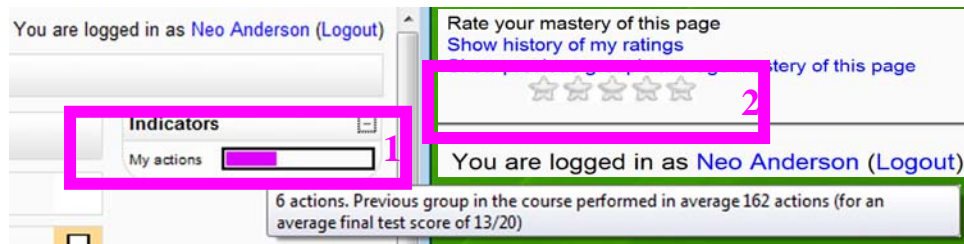
Figure 3. In this mock-up, reflection is triggered by widgets mirroring personal tracked data (here: number of actions performed in the course) or asking the learner to rate his current perceived level of mastery.