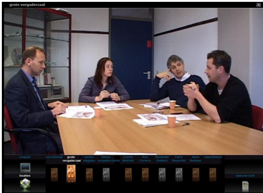
Figure 2. Screenshot of the VIBOA environmental consultancy game

The first VIBOA game is an introductory game, which is concluded with a test for checking and aligning prior knowledge. For each of the other four games the students have to deliver a report, which specifies their approach, their analysis and their proposed solutions. These reports are the basis of the formal examination.