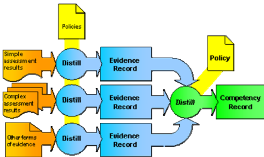
Figure 2 Summary of the competency evidence distillation process (see online version for colours)

Ostyn (2005) attempted to solve this problem by proposing a concept of distillation of competence information. According to his approach (see Figure 2), a confidence rating is introduced to qualify the evidence record and the competence record. The confidence rating is pre-determined according to a policy. An example policy was given that specifies the confidence ratings to apply for various types of evidence as shown in the Table 1. Adopting this method, an evidence record or a competence record with a higher confidence rating according to the policy will be selected as the competence estimate and others will not be taken into account. For example, the results of a properly conducted 360 degree assessment (rating = 0.75) are more credible than an assessment result from a supervisor (rating = 0.7), and in turn, this result is more credible than that from a self-assessment (rating = 0.1) or an online assessment on an unsecured computer somewhere on the internet (rating = 0.2).