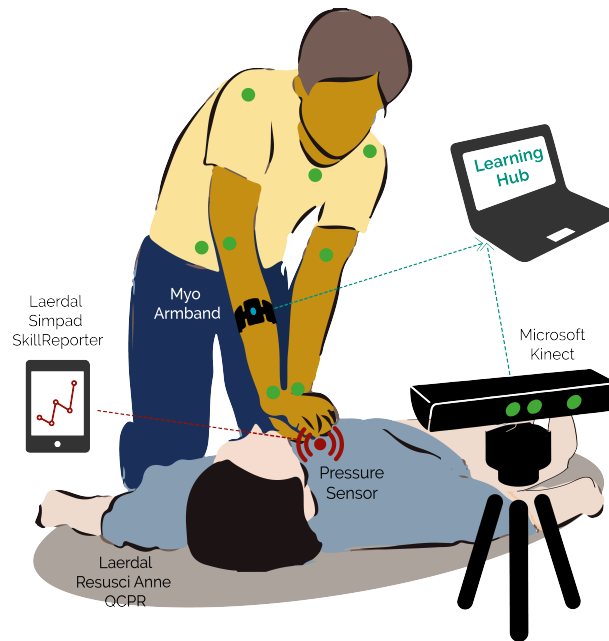
Fig. 1. The graphic representation of the experimental setting