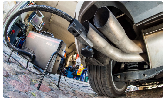
photo 1 Measuring pollution of a Volkswagen Golf 2.0.

As traditionally many savings did occur in the hardware side of a computer, energy consumption is a blind spot when developing software. Each next hardware generation consumed less energy for performing the same amount of work. However, recently this development has lost its pace. At the same time, it becomes more and more clear that software has a huge impact on the behaviour and the properties of devices it runs on. A recent example of software influencing the working of a device is the Volkswagen scandal, where Volkswagen used software to detect if the car was being tested, and if so made the diesel motor exhaust less toxic gases (see photo 1). In [OZH16] it is calculated that 44,000 years of human life are lost in Europe because of the fraud, which lasted at least 6 years. Another example are fridges from Panasonic, which could detect if a test was going on and suppressed energy intensive defrost cycles during this test. Although these are negative examples, it does make clear that the software is in control of the device and its (energy) behaviour.