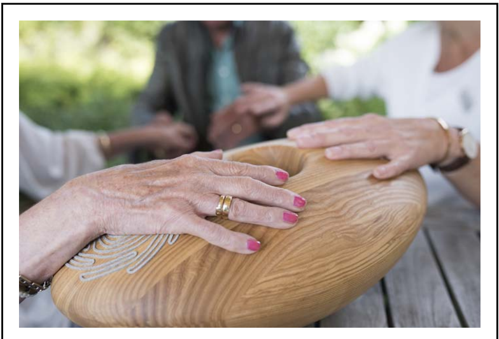
Plate 1 The interactive object CRDL

The CRDL (pronounced: “the cradle”) got its name due to its shape, size and weight, which refer to a baby or a crib. Physically, the CRDL has an abstract, rounded form. On opposite sides of the device, there is a grey felt inlay shaped like a larger-than-life fingerprint. Two participants have to place one hand on such a felt “pad” and simultaneously touch the other person’s skin (e.g. hand, arm or shoulder). If more people are interacting, they all have to touch each other. This way they