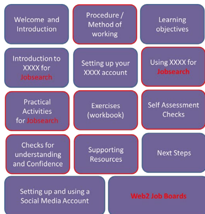
Fig. 2 web2jobs module template

Following this feedback a template (Fig. 2) was designed to guide the redesign of the modules, describing constituent parts and stressing the job search aspect. Moreover, workbook and PowerPoint templates were designed to be used for exercises and presentations.