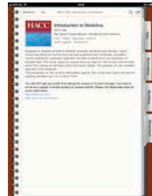
course in iTunesU on an iPad

iTunes U is a platform developed by Apple where users of iOS devices can access a large range of freely available educational resources. However, a lot of the material cannot be reused subject to an open licence.