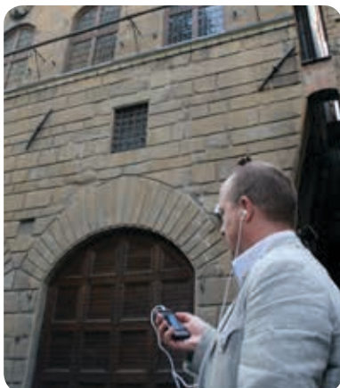
Student fieldwork in Florence supported by Augmented Reality

A number of higher education institutions are implementing pilots to identify the didactic scenarios in which learning with mobile devices can offer added value, and to determine how mobile learning can be integrated into the educational process after the pilots have been completed. The educational resources and apps utilised can be categorised as OER.