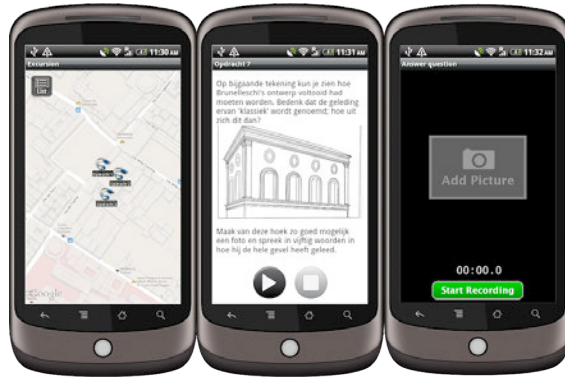
Fig. 2. ARLearn mobile application

The demonstration will showcase the different tools accompanied by a number of mobile devices to showcase the mobile application. The mobile application is currently only available for Android (Version 2.2 or higher). The application can be downloaded for free via the Google Play Store. In the context of the conference demonstration interested users can either download and install the application on their own devices or interact with the application on a limited number of demonstration devices. Figure 2 shows the mobile application for Android.