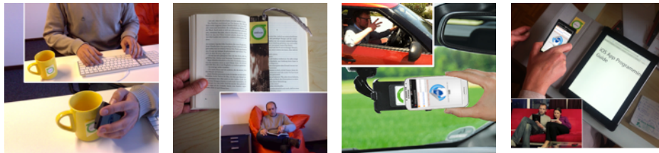
a) Write a blog entry at coffee time when I arrive to work b) Reading a pocket-book in waiting times c) Listening foreign language podcasts in car transitions d) Watch MOOC videos in tablet on the coach in commercial breaks

Lifelong learners recur to specific locations (e.g. desktop, coach) and moments (e.g. waiting times, transitions) to accomplish their learning activities along the week [4]. Learning activities should be tracked in a way that the transition from/to daily life activity can be done with effortless interaction, otherwise the user will not bother to track such a short learning moments, and as result it will never be accounted as learning time.