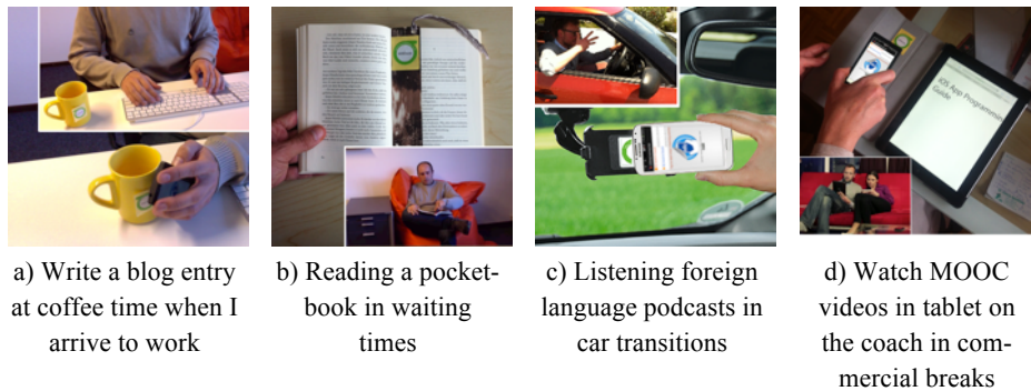
Fig. 2. Learning activities (write, read, listen, watch) bound to daily learning environments

Lifelong learners recur to specific locations (e.g. desktop, coach) and moments (e.g. waiting times, transitions) to accomplish their learning activities along the week [4]. Learning activities should be tracked in a way that the transition from/to daily life activity can be done with effortless interaction, otherwise the user will not bother to track such a short learning moments, and as result it will never be accounted as learning time.