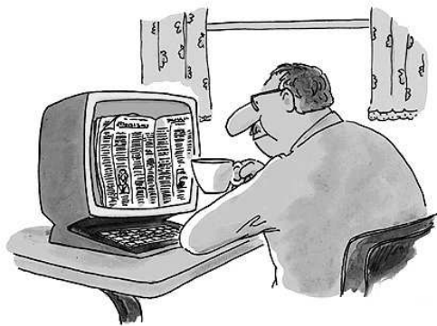
Figure 2 Implementing old patterns in new technologies.

Likewise, e-learning developers also seem to prefer maintaining existing methods and habits for a great deal, while merely adding new technologies. Indeed, most online education efforts concern electronic replicas of existing media, i.e. the transfer of learning content from books into web-”pages”.