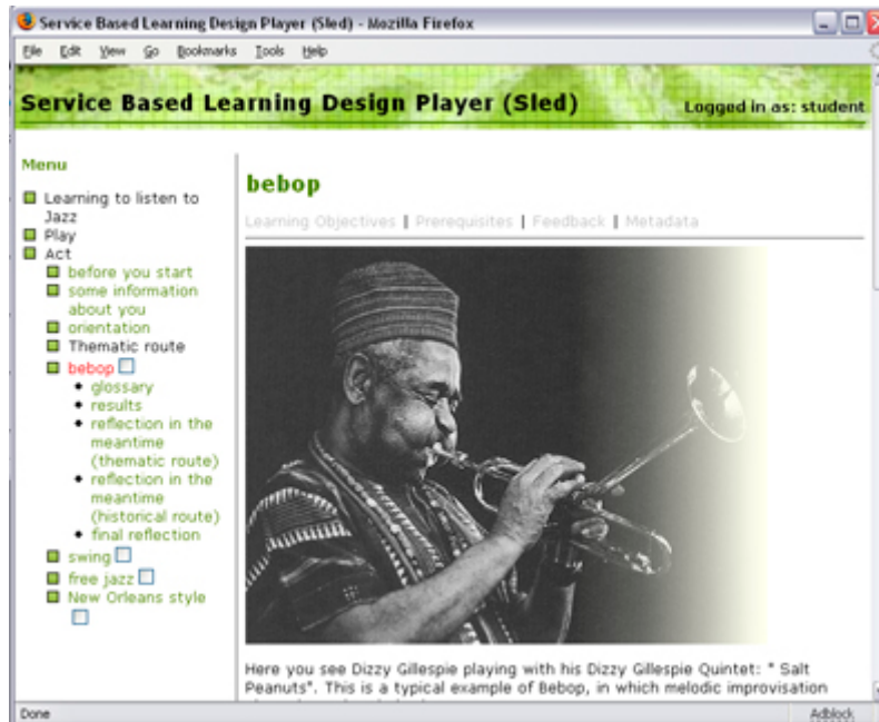
Fig. 3. Viewing the Jazz Course in the SLeD Player